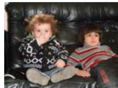
Children of single mothers at Dzegvi Shelter