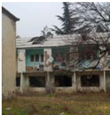
Building needed for expansion at Dzegvi Community Shelter

Many people who are internally displaced, in poverty with no employment opportunities, ill without adequate care and orphans are living on aid from AFG and other international organizations.