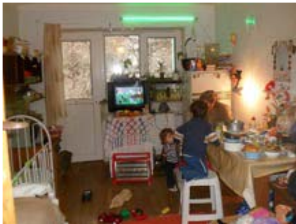
Room at Dzegvi. This family is a grandmother taking care of two of her grandchildren.